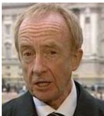
BBC MAN "WITCHELL"