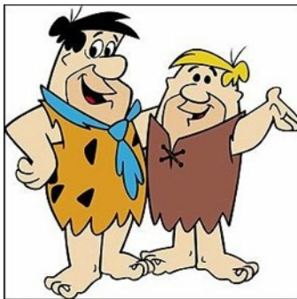
FRED AND BARNEY