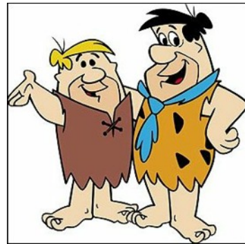
BROOKSIE AND TELLWRIGHT