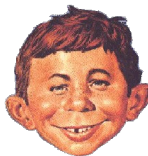
'ARK AT 'E MOORFOOT