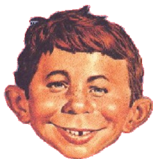
"ALFRED E NEWMAN"